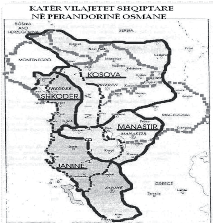
Four vilajets of Albania, under the Ottoman rule